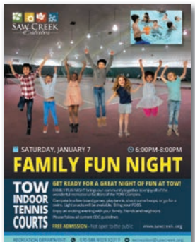
Family Fun Night Jan. 7 @ 6pm

For a full calendar of upcoming events please visit www.sawcreek.org