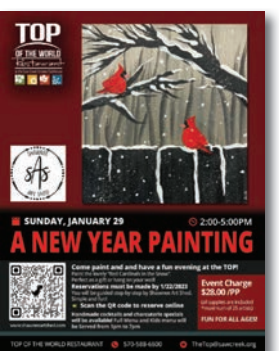
New Year Painting Jan. 29 @ 2pm