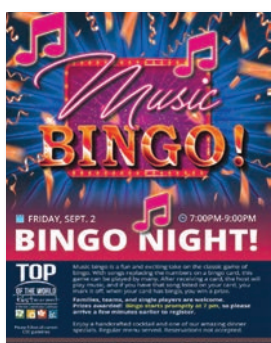
Music Bingo Night Sept. 2 @ 7:00pm

For a full calendar of upcoming events please visit www.sawcreek.org