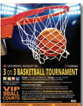
3 on 3 Basketball August 20 @ 9:00am