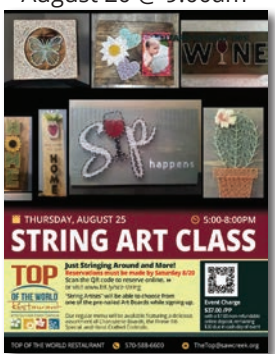
String Art Class August 25 @ 5:00pm