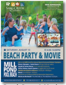
Beach Party & Movie August 13 @ 6:00pm