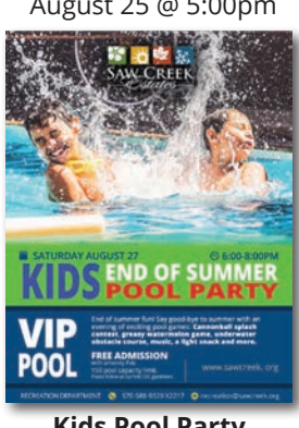
Kids Pool Party August 27 @ 6:00pm