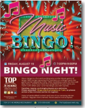
Music Bingo August 19 @ 7:00pm