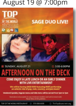
Sage Duo Live August 21 @ 3:00pm