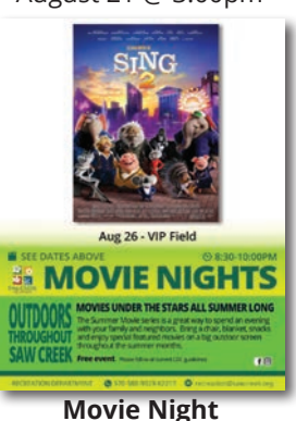
Movie Night August 26 @ 8:30pm