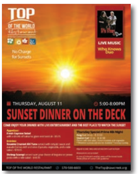
Sunset Dinner w Music August 11 @ 5:00pm

For a full calendar of upcoming events please visit www.sawcreek.org