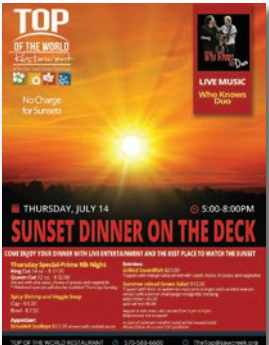
Sunset Dinner July 14 @ 5:00pm