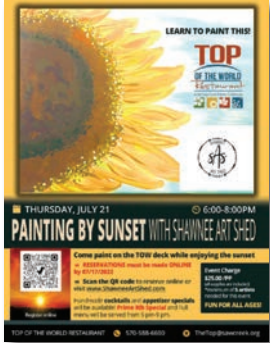
Sunset Painting Class July 21 @ 6:00pm