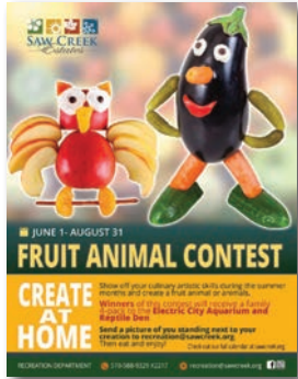
Summer Contest June-August

For a full calendar of upcoming events please visit www.sawcreek.org