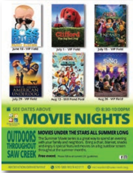
Summer Movie Nights July 15, 29 @ 8:30pm