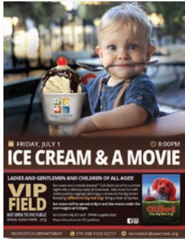
Ice Cream & Movie July 1 @ 8:00pm