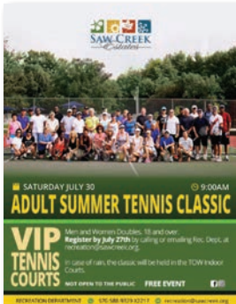
Adult Tennis Classic July 30 @ 9:00am