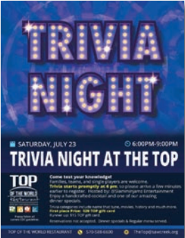
Trivia at the TOP July 23 @ 6:00pm