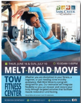
Melt Mold Move July 10 @ 10:00am