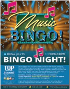
Music Bingo July 29 @ 7:00pm