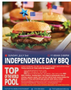
TOW BBQ July 3 @ 11:00am