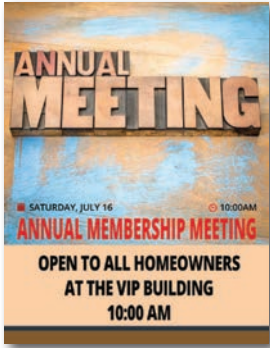
Annual Meeting July 16 @ 10:00am