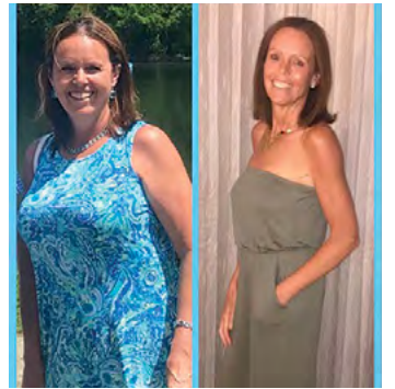
I lost 40 lbs. in 4 months, have increased energy, better sleep, and so much more!

Let me help you transform your body. No exercise required!