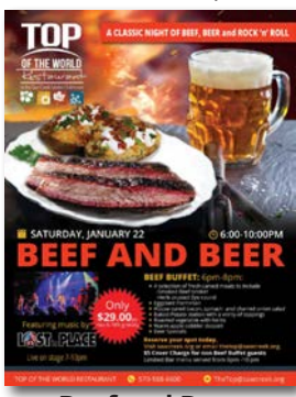
Beef and Beer Jan. 22 @ 6pm