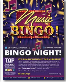
Music Bingo Jan. 16 @ 5pm