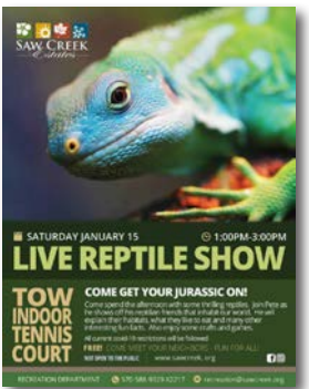
Live Reptile Show Jan. 15 @ 1pm