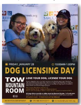
Dog Licensing Day |an. 28 @ 10am