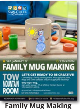
Jan. 22 @ 3:30pm