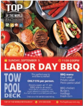
Labor Day BBQ Sept. 5 @ 11am-3pm

For a full calendar of upcoming events please visit www.sawcreek.org