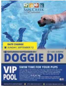
Doggie Dip Sept. 12 @ 1pm-3pm