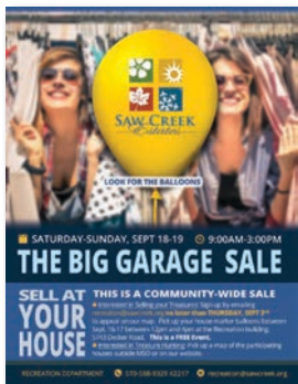
Garage Sale Sept. 18-19 @ 9am-3pm