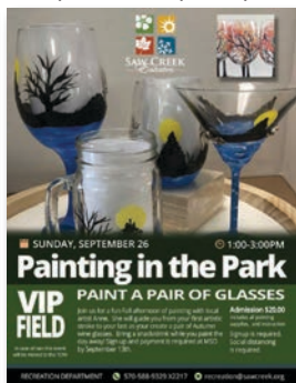
Painting in the Park Sept. 26 @ 1pm-3pm