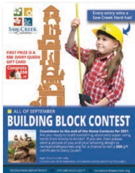
Building Block Contest All of September