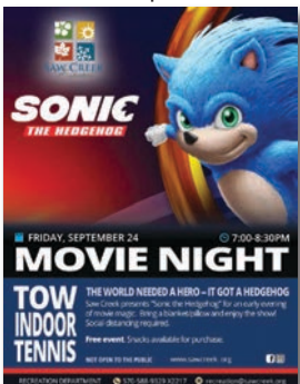
Movie Night Sept. 24 @ 7pm-8:30pm