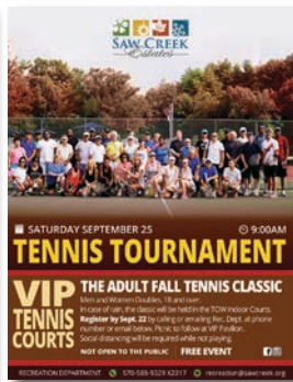
Tennis Tournament Sept. 25 @ 9am