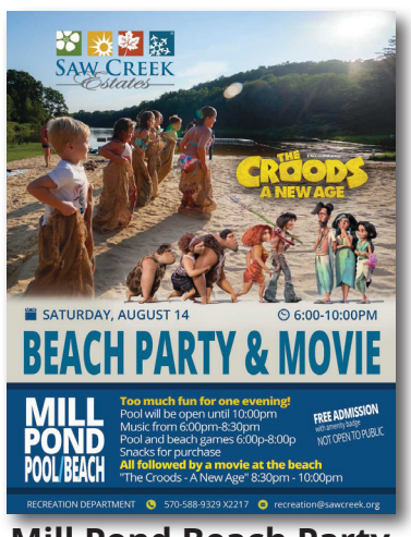
Mill Pond Beach Party