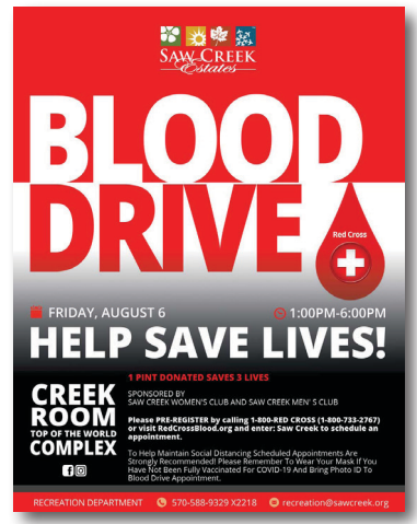
Blood Drive August 6 @ 1:00 pm

For a full calendar of upcoming events please visit www.sawcreek.org