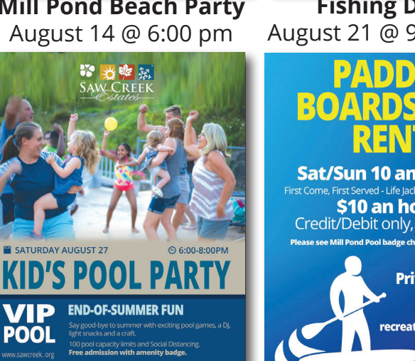
Kid's Pool Party August 27 @ 6:00 pm