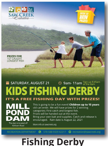
August 21 @ 9am-11am