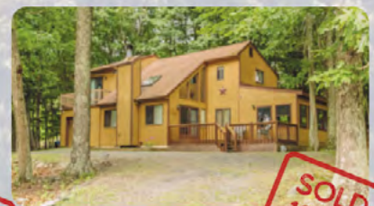
134 Ashley Court