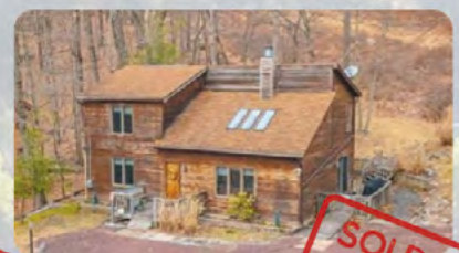
5081 Woodbridge Drive