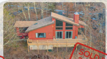
193 Dover Drive