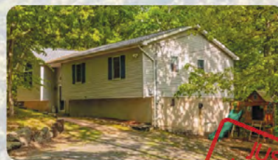
119 Canterbury Road