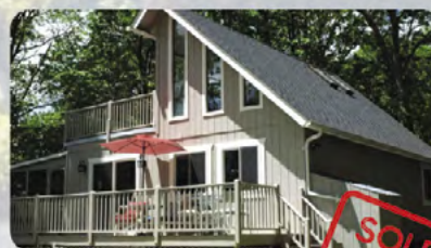
169 Dover Drive