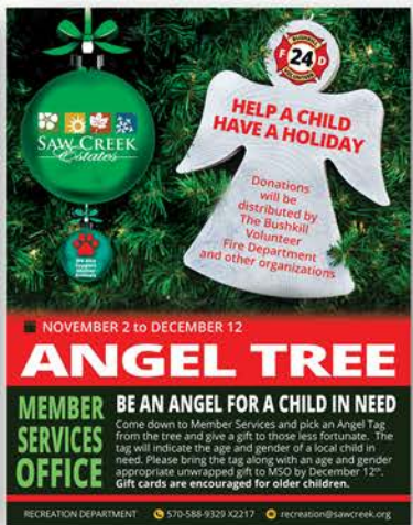
Angel Tree Runs until December 12th