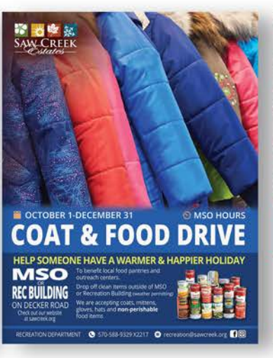
Coat & Food Drive Runs until December 31st