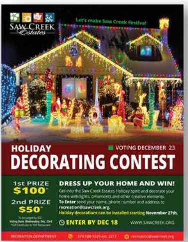
Decorating Contest Enter by December 18th