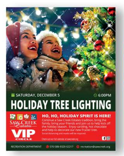
Tree Lighting December 5th

For a full calendar of upcoming events please visit www.sawcreek.org